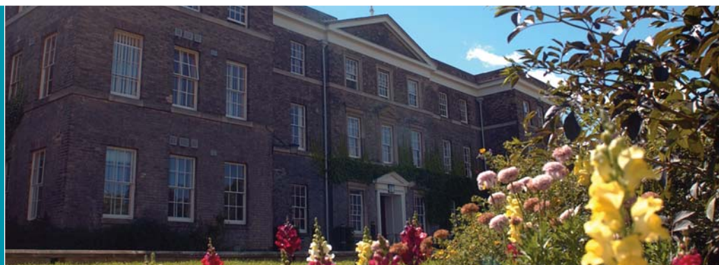
The Fielding Johnson Building