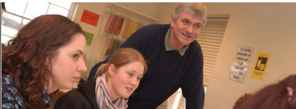
Teaching in the ELTU