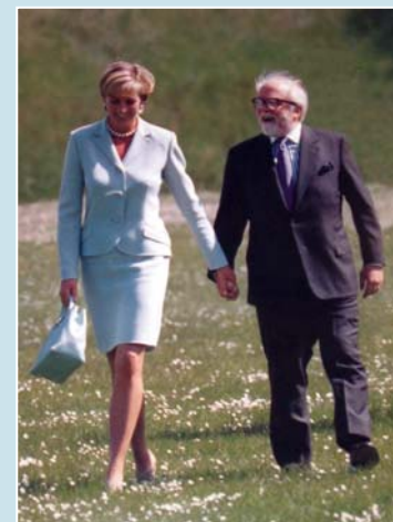
Princess Diana and Sir Richard Attenborough at the opening of the Richard Attenborough Centre

You can find more information at www.le.ac.uk/racentre