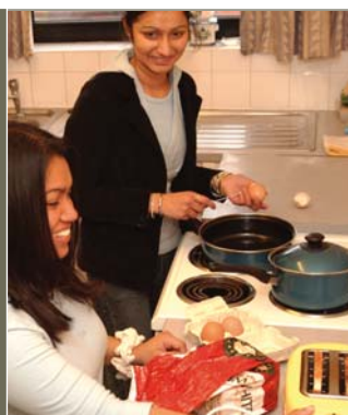
Student life in Leicester