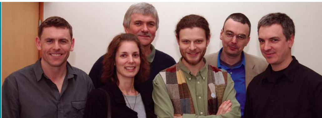
Some of the ELTU staff